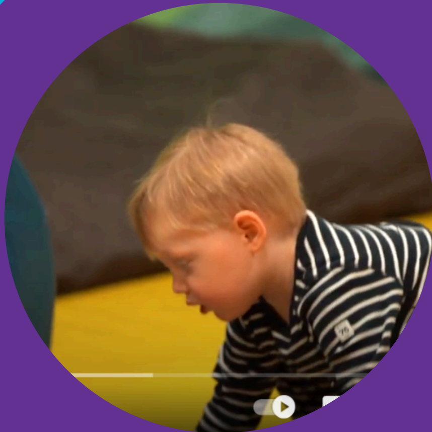
Hugo's Sensational Story